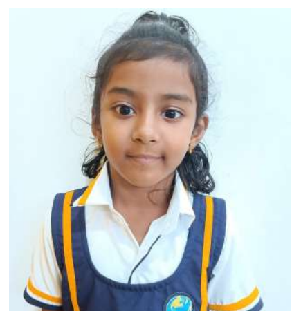
Dhikshaya - K3 Litchi