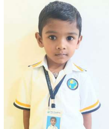
Juhithsai A - K2 Litchi