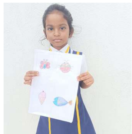
Swathika K3 Litchi